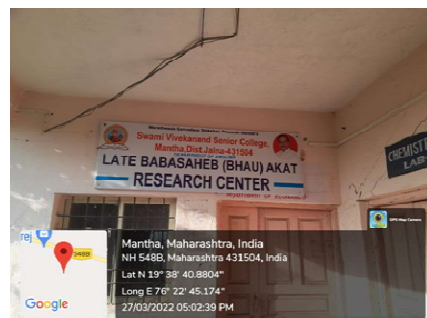
Display boards and signposts