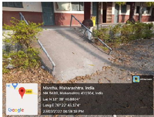
Ramp for disabled persons

Swami Vivekanand Senior College Mantha provides barrier-free environment where people with disabilities can move about safely and freely and use the facilities within the built environment. The environment supports the independent functioning of individuals so that they can participate without assistance in everyday activities within the campus. Buildings / places / transportation systems are made barrier free.