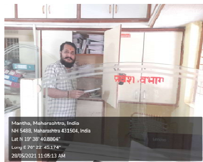
Provision for enquiry and information : Human assistance