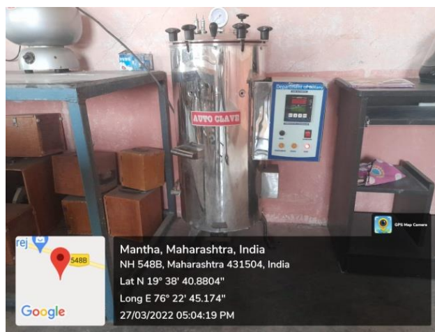
Use of autoclave for fungal culture discarding (Biomedical waste management)