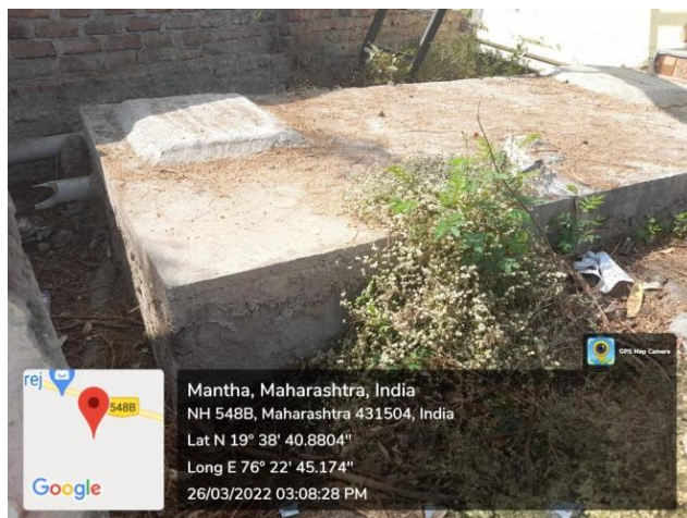
Septic tank for Liquid waste management