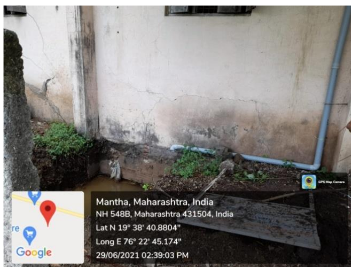
Hazardous waste management